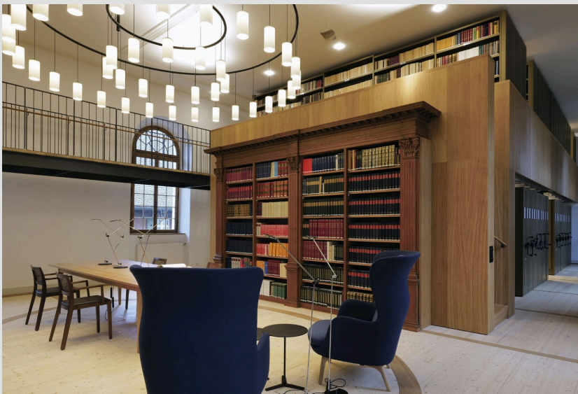
[Image 1] A new library room with study and reading space

In the second feasibility study, of 2019, the construction of an underground archive room with a mobile shelving system was abandoned. Instead, the two library rooms were to double as the archive room. Instead of freestanding shelves, the open-shelf library was now given a mobile shelving system. This does not apply to the historical book collection, which is kept under lock and key in different mobile racks. The old historical bookcases from the 19th century have been incorporated into the new spatial concept and the idea of an open-shelf library: they are used to display the current year's periodicals and new acquisitions of monographs, and provide quick access to the most important encyclopaedias and Bible commentaries. Architecturally, they provide the framework for the newly created reading room at the centre of the now combined halls. Visually, this design element is arranged in such a way that the mobile shelving system, which now houses the entire monastery library and music collection, appears unobtrusive.